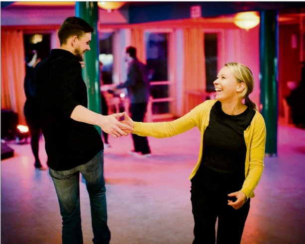
Lindy hop is a fun and energetic partner dance with its roots in the 1930s Harlem, New York. The Swing Night takes place on April the 21st in Vaasa.

One will have the opportunity to try out your new moves on the dance floor as the taster turns into a swing night featuring a potluck party, groovy music, social dancing and friendly faces.